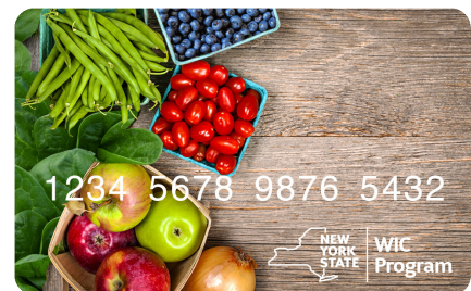
the eWIC card